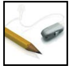
Open Fit Hearing Aid

This style can address more types of hearing loss than any other. It is much smaller and comes in a variety of colors that blend with skin and hair color. Over half our patients choose BTEs for this reason. It is also the only style that will work for severe and profound hearing losses. Open-fit hearing aids fall under this style as well.