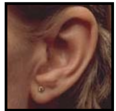
CIC or Completely-in-the-ear hearing

The Completely-In-The-Canal hearing aid is designed to fit just as its name implies – completely inside the ear canal. The cosmetic appeal of this style depends largely on the size and shape of the wearer's ear canal. Manufacturing limitations, the shape of the ear canal and patient comfort all factor into the size of the device.